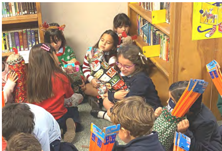
ALL THE CHILDREN ARE THRILLED WITH THEIR GIFTS AND PATIENTLY WAIT TO OPEN THEM.

One young boy in particular captured the true spirit of Christmas—the pure joy on his face was unforgettable, reminding everyone that the season is about love, generosity, and the happiness of giving.