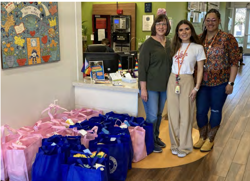
MARSHA OF THE CHRIST CHILD SOCIETY OF TUCSON DELIVERS 20 CAREFULLY PREPARED LAYETTES TO CASA DE LOS NIÑOS, PROVIDING ESSENTIAL ITEMS TO SUPPORT NEW MOTHERS AND THEIR NEWBORNS IN THE COMMUNITY.