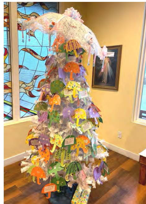
OUR LADY OF THE DESERT BABY SHOWER TREE IS COVERED WITH TAGS FOR PARISHIONERS TO TAKE TO PURCHASE GIFTS FOR WALKING WITH MOMS IN NEED AND TEENAGE PREGNANCY PROGRAM.