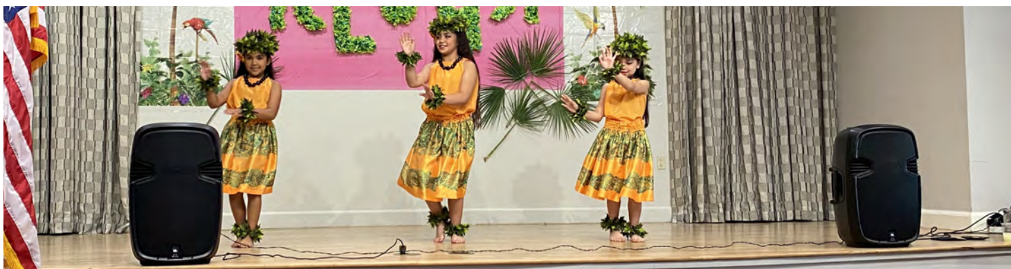
THE YOUNGEST HULA DANCERS STOLE THE SHOW, CHARMING THE AUDIENCE WITH THEIR SMILES, ENTHUSIASM, AND ISLAND SPIRIT.