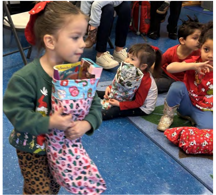
A SANTA'S ARRIVAL BRINGS HOLIDAY MAGIC TO THE STUDENTS OF OUR MOTHER OF SORROWS CATHOLIC SCHOOL.