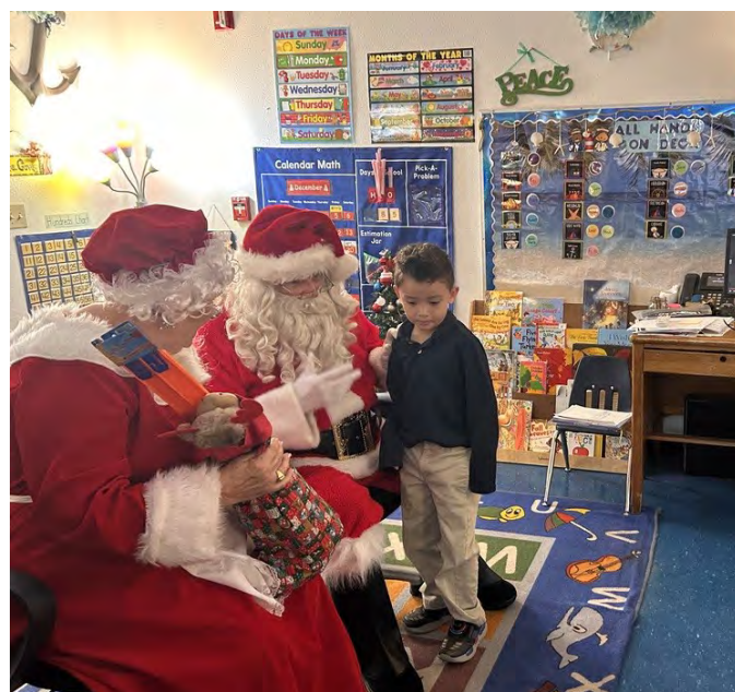
A CHILD AT ST AMBROSE LISTENS INTENTLY TO SANTA.