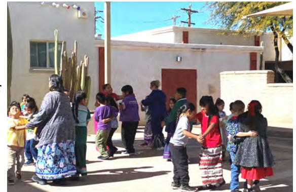
THE CHILDREN OF SAN XAVIER MISSION SCHOOL PERFORMED A NATIVE DANCE FOR THE VOLUNTEERS.