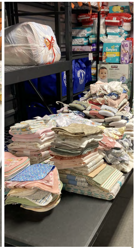
HERE ARE PICTURES OF THE QUANTITY AND QUALITY OF THE BEAUTIFUL ITEMS WE RECEIVE EACH MONTH FROM CREATIVE GIVING.