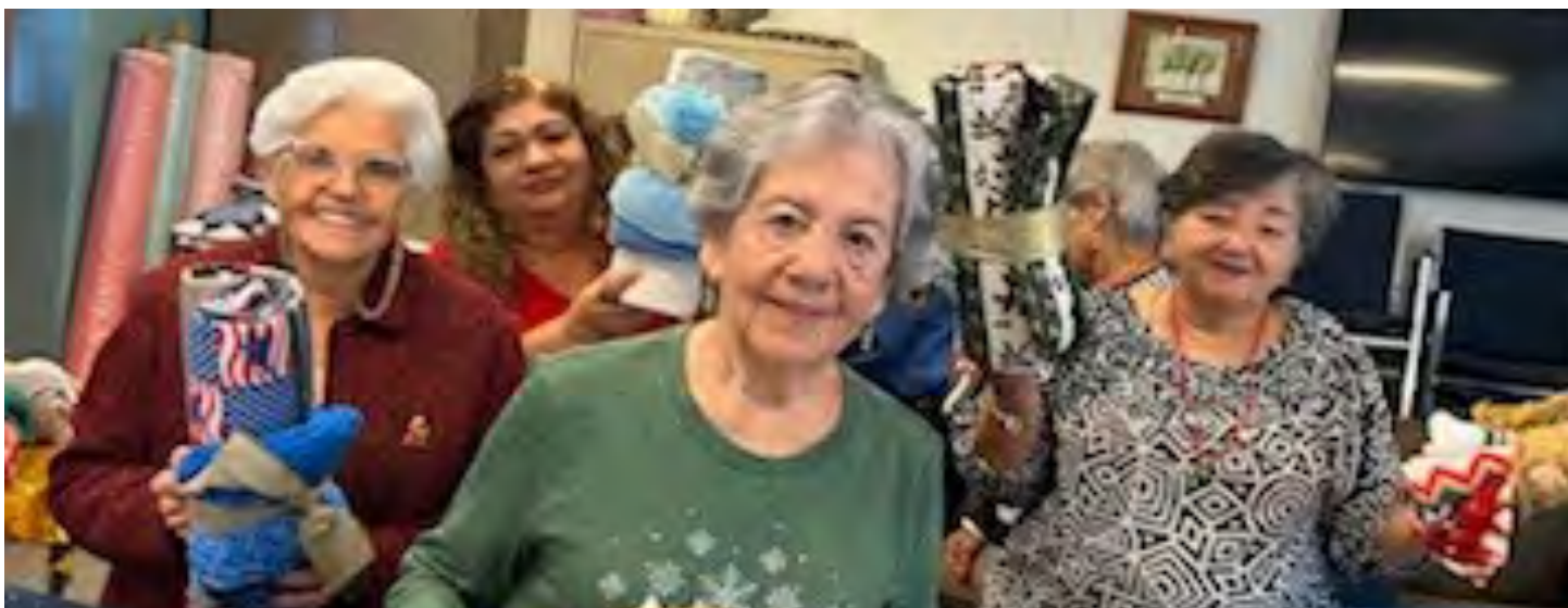
THE SENIORS AT BARRIO VIEJO ENJOY RECEIVING A GIFT OF A COZY BLANKET.