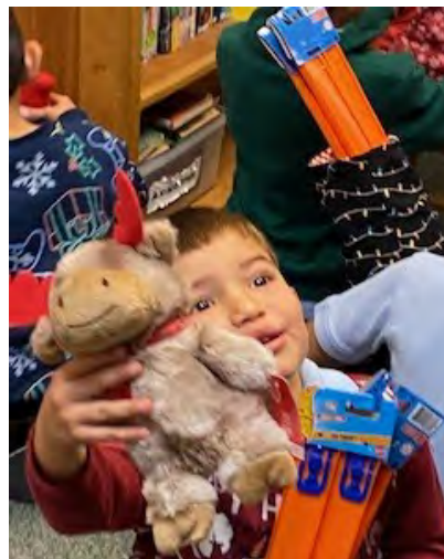
CHRISTMAS JOY IN EVERY