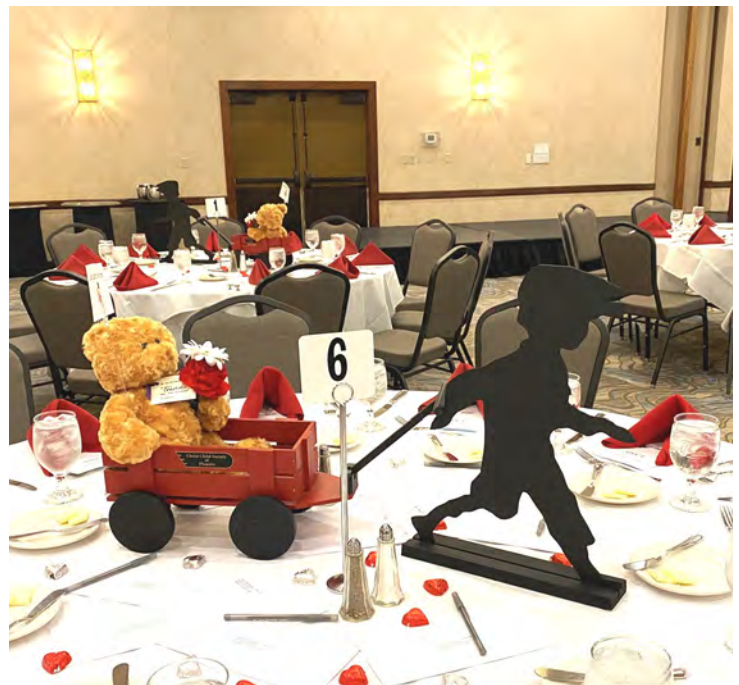
CCSP PLACE SETTING WITH TRADITIONAL RED WAGON AND SILHOUETTE OF THE BOY PULLING IT.