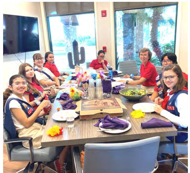
THE AMERICAN HERITAGE GIRLS AND THEIR LEADER HAVE A MOMENT TO REST AFTER ALL THEIR HARD WORK AT THE LUAU.