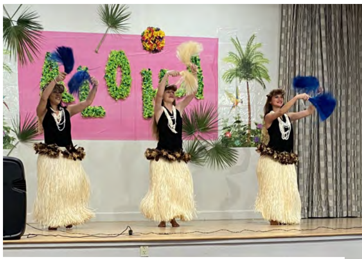
WITH GRACEFUL HAND MOVEMENTS AND RHYTHMIC STEPS, THE DANCERS SHARED THE BEAUTY AND STORYTELLING TRADITION OF HAWAIIAN HULA.