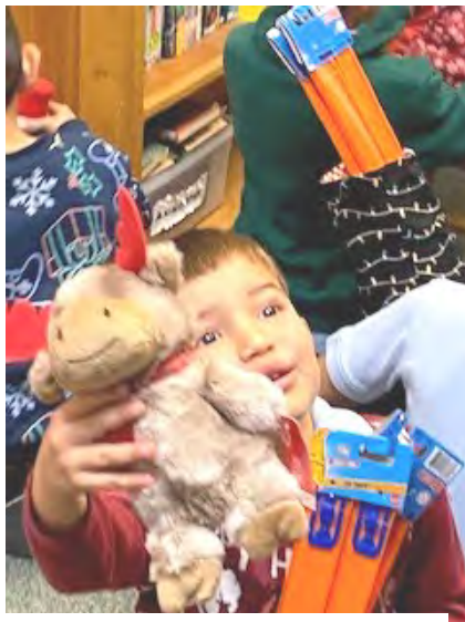
A CHILD AT IMMACULATE HEART SCHOOL BEAMS WITH DELIGHT AS HE RECEIVES HIS GIFT.