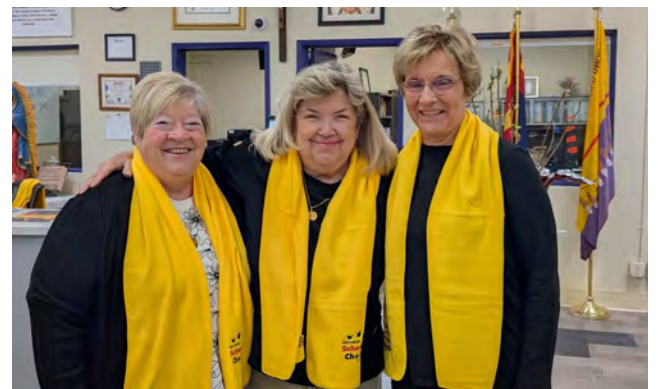
MEMBERS OF THE CHRIST CHILD SOCIETY OF TUCSON VISIT SAN XAVIER MISSION SCHOOL DURING CATHOLIC SCHOOLS WEEK TO CELEBRATE THE PARTNERSHIP THAT SUPPORTS YOUNG READERS.