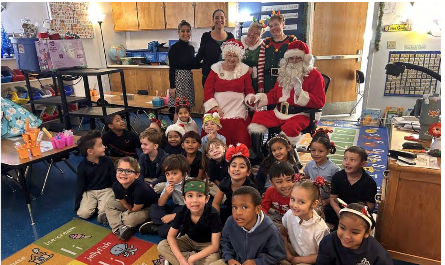
EXCITEMENT FILLS THE CLASSROOM AS SANTA SPREADS FESTIVE CHEER AT OUR MOTHER OF SORROWS CATHOLIC SCHOOL.