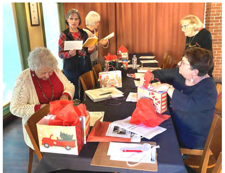
CHRIST CHILD LADIES CELEBRATE THE SEASON WITH LITTLE GIFTS.