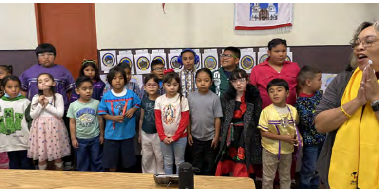
THE WARM WELCOME FROM THE STUDENTS OF SAN XAVIER MISSION SCHOOL MADE THE VISIT ESPECIALLY MEANINGFUL FOR CCST VOLUNTEERS.