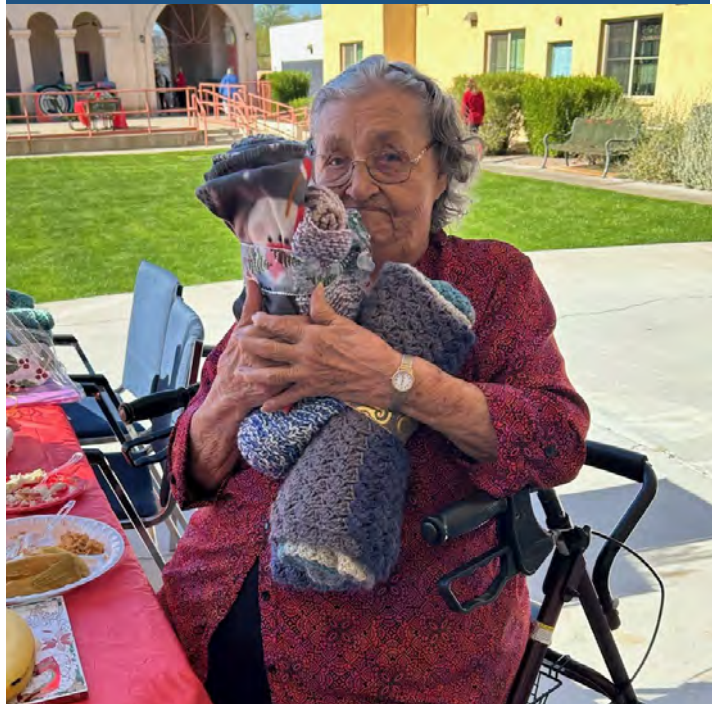
A SENIOR HUGS HER GIFT OUTSIDE THE BARRIO VIEJO ELDERLY HOUSING.